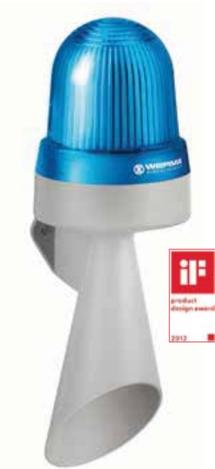
Multi-functional LED beacon: 3 light effects can be triggered externally