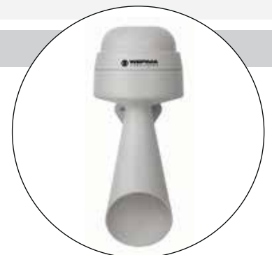
Loud, long-life horn for a diverse range of applications (see page 37)