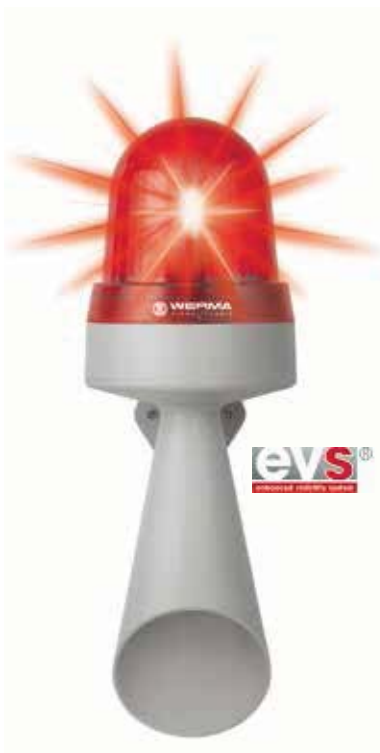
The "EVS" light effect ensures a maximum attention-grabbing effect